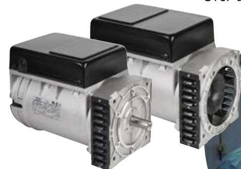
T16F and S16F